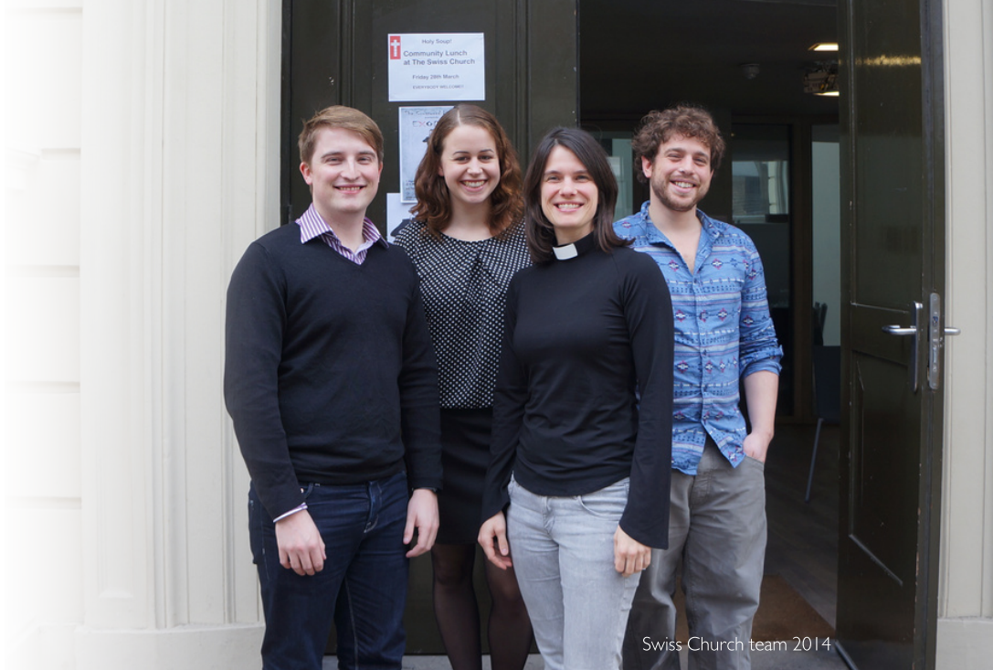
Swiss Church team 2014