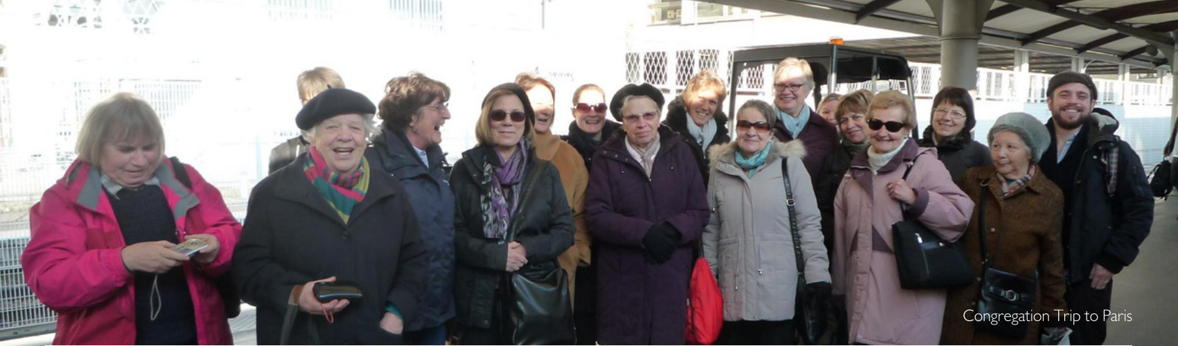
Congregation Trip to Paris