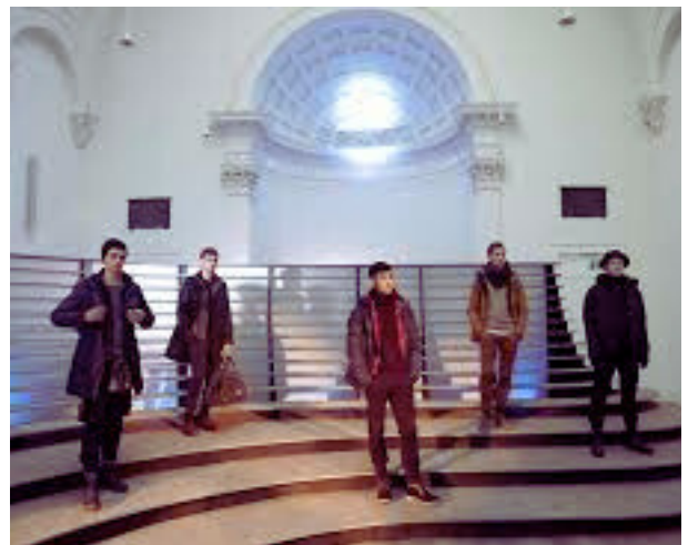
London Fashion Week performance